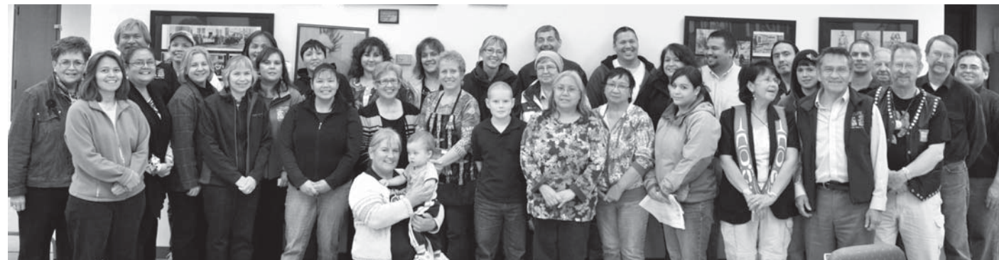
Petersburg Community Visit Group Photo