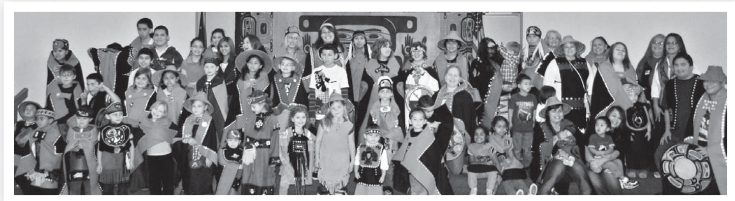
All Nations Children